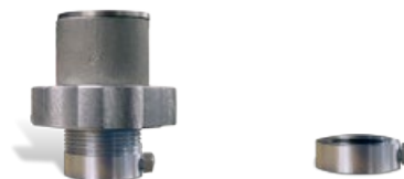
Bracket arm height adjuster (left) compared with standard set collar (right)