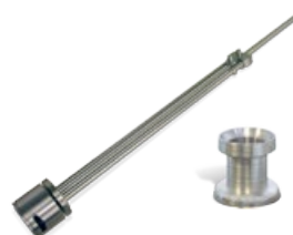
Plungers and cylinders

A variety of plungers and cylinders are available for Type B and F depositors. (See Plungers / Cylinders page)